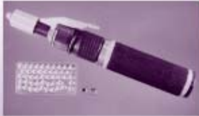
Captive Bolt Device and Charges

4) Exsanguination: This method can be used to ensure death subsequent to stunning, anesthesia, or unconsciousness. It must not be used as the sole method for euthanasia.